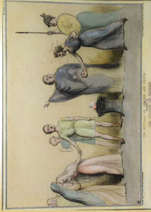
THE NUPTIALS of PEELEUS and THETIS interrupted by the Goddess of Discord.